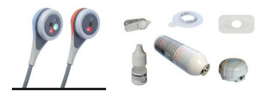
Figure 1 – A sampling of transcutaneous monitoring equipment, sensors, and application devices. (SenTec AG, Ringstrasse 39, CH-4106 Therwil, Switzerland, <u>www.sentec.ch</u>)